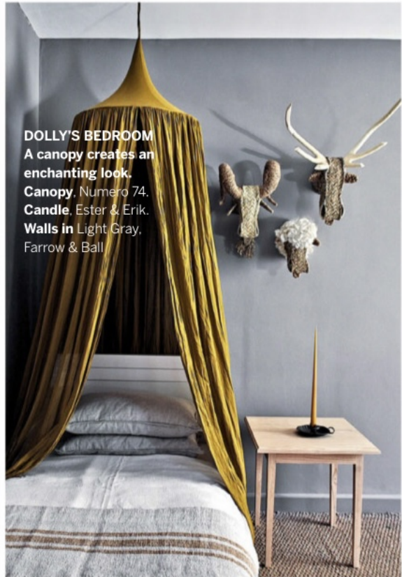
DOLLY'S BEDROOM A canopy creates an enchanting look. Canopy, Numero 74. Candle, Ester & Erik. Walls in Light Gray, Farrow & Ball