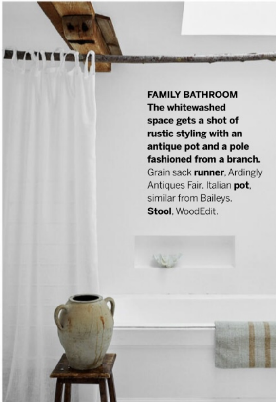
FAMILY BATHROOM The whitewashed space gets a shot of rustic styling with an antique pot and a pole fashioned from a branch. Grain sack runner, Ardingly Antiques Fair. Italian pot, similar from Baileys. Stool, WoodEdit.